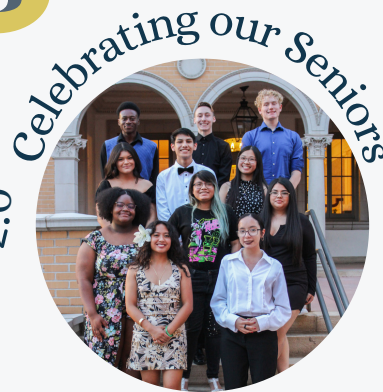
Celebrating our Seniors