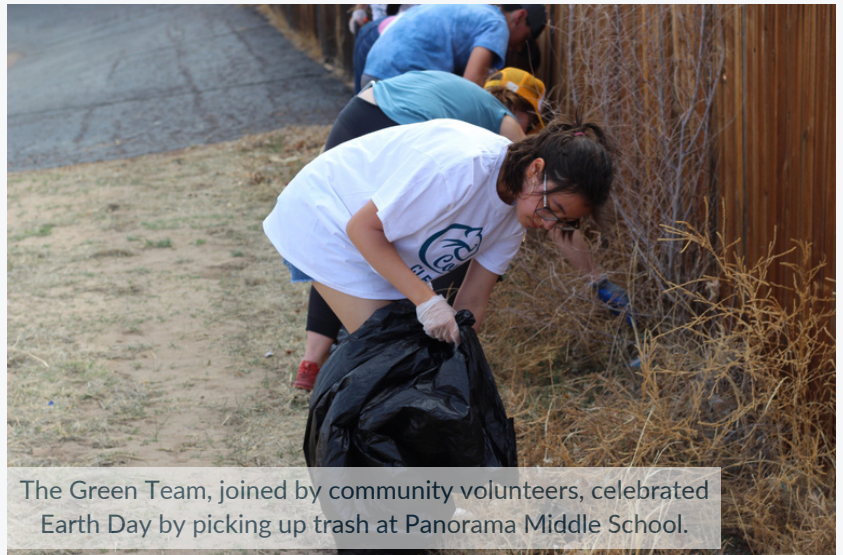
The Green Team, joined by community volunteers, celebrated Earth Day by picking up trash at Panorama Middle School.

In January, we kicked off our second year of the Impact Service Project, made possible through a grant from L3Harris. By participating in the ISP, Peak Education Scholars have the chance to take on some of our community’s biggest challenges. In response to problems identified in local businesses, nonprofits, and educational institutions, students work in small group teams—with the support of a coach—to identify root causes of local area problems and identify solutions.