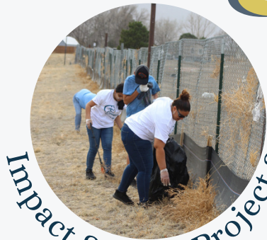
Impact Service Project 2.0